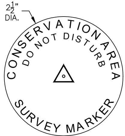
ALUMINUM CAP DETAIL

L:\CADD\PRODUCTS\MONUMENT MARKERS\NYSDECMM_R0.dwg