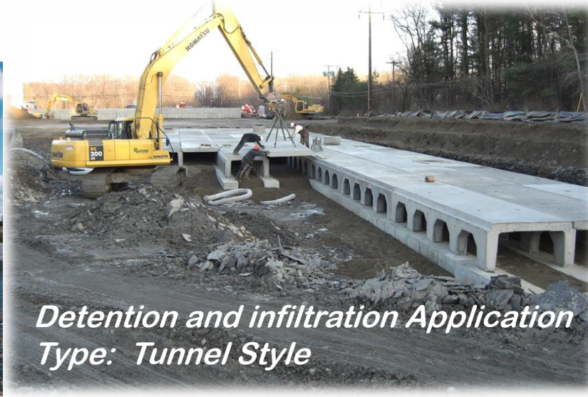
Detention and infiltration Application Type: Tunnel Style